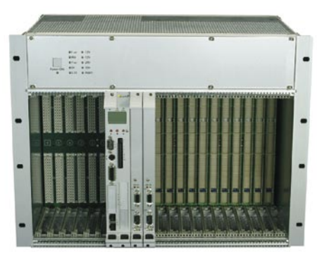
INAT-S5 / CPCI module rack