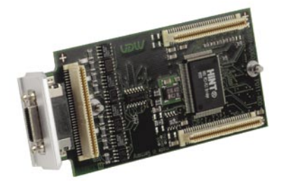
PC-MIP module 4 x RS422 / 485