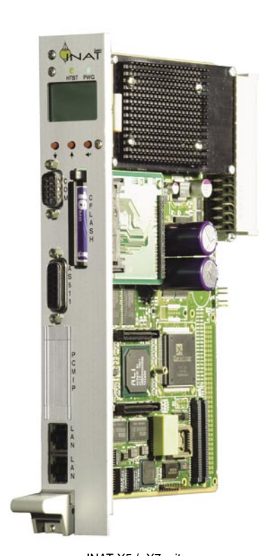
INAT-X5 / -X7 mit 10 / 100 Mbps Ethernet

• Including serial parameterization cable (see page 48)