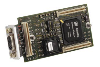
PC-MIP module resolution 1.280 x 1.024