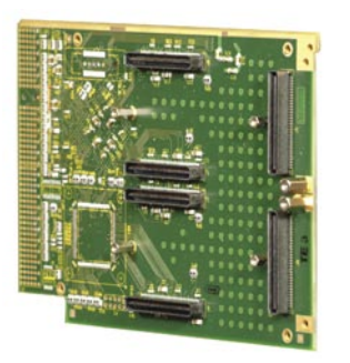
PC-MIP extension board