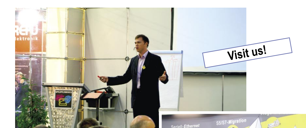
INAT at the SPS / IPC / Drives 2004

Again in 2005 we want to meet you for one-on-one interviews. There are several possibilities to meet us: