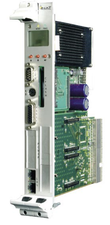
INAT CPCI CPU with 10 / 100 Mbps Ethernet