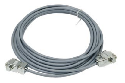
Serial parameterization cable