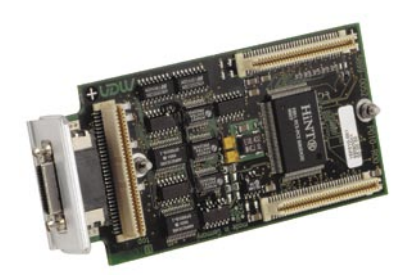
PC MIP module 4 x RS232