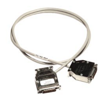
PLC cable S5-CP/PLC